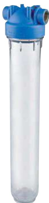
20" MONO TS