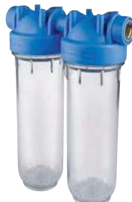
10" DUO TS