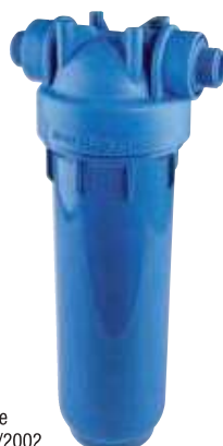
10" MONO MP AB

DRAIN FUNNEL Back-flow preventing device UNI EN 1717-11/2002