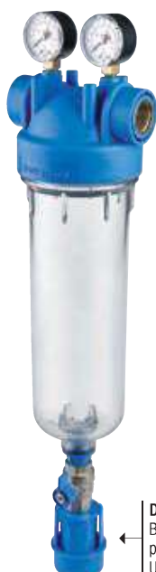
10" S M MONO TS

DRAIN FUNNEL Back-flow preventing device UNI EN 1717-11/2002