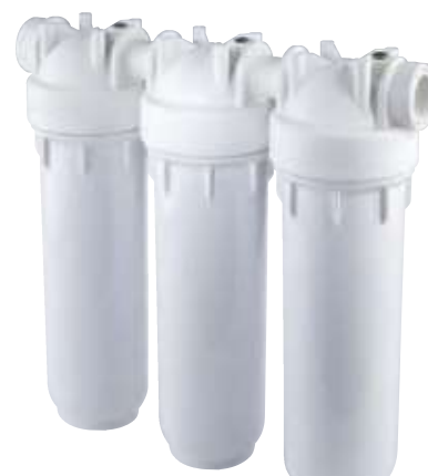
10" TRIO BW